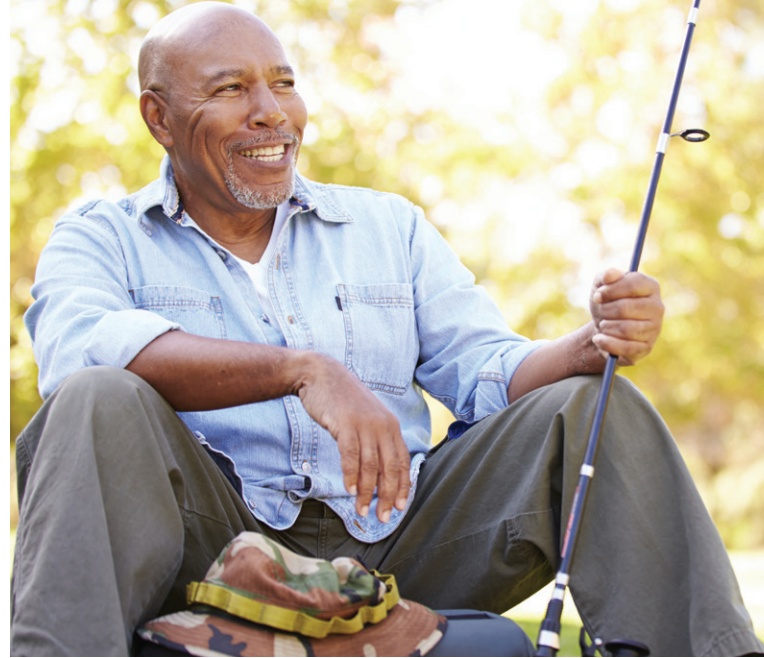
Total Knee Replacement

in the femur. Any of these three areas of contact can fall victim to the wear and tear effects of arthritis – causing pain, heat, stiffness and swelling. Total knee replacement involves the replacement of all three surfaces with metal and plastic components. If arthritis is limited to either the lateral or medial compartment of the knee, partial knee replacement may be considered.